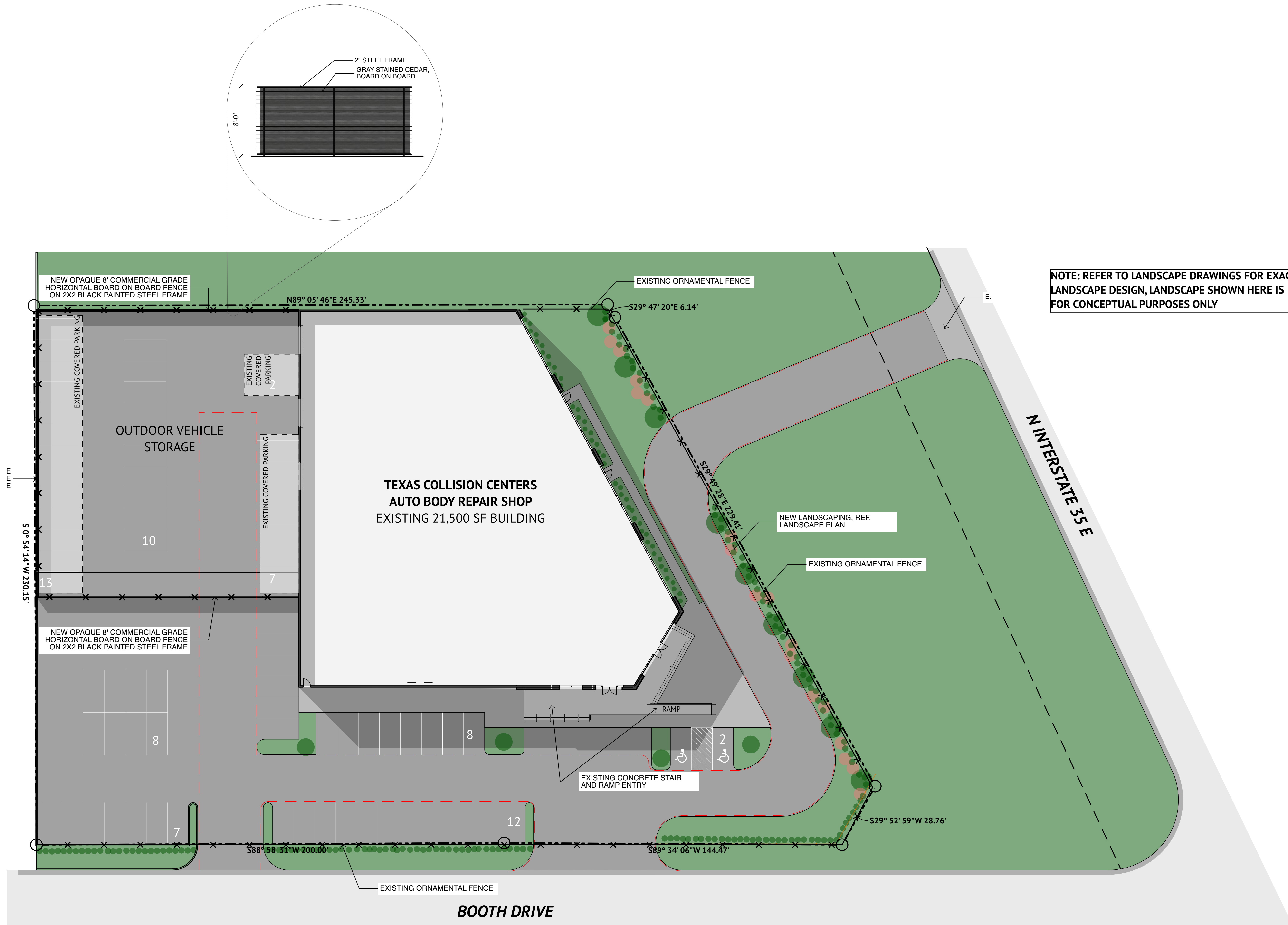
1 CONCEPT SITE PLAN SCALE: 1" = 20'

TEXAS COLLISION CENTERS 1875 N INTERSTATE 35 E CARROLLTON, TX