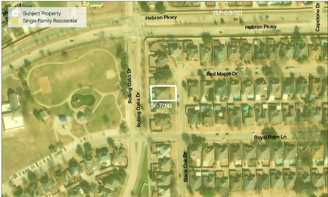
EXHIBIT A GENERAL DEPICTION