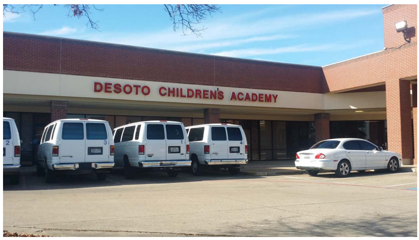
MATERIALS PROVIDED BY THE APPLICANT, Showing a similar facility in Desoto, Texas