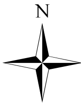
1825 N. IH35 EXHIBIT B