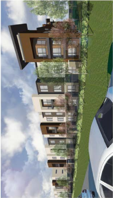
3D VIEW - SOUTHWEST CORNER