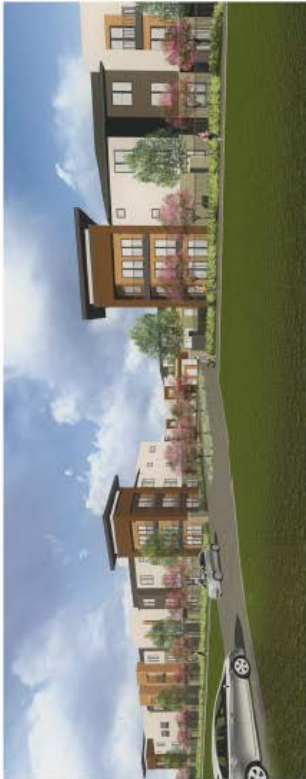
3D VIEW - SOUTHEAST CORNER