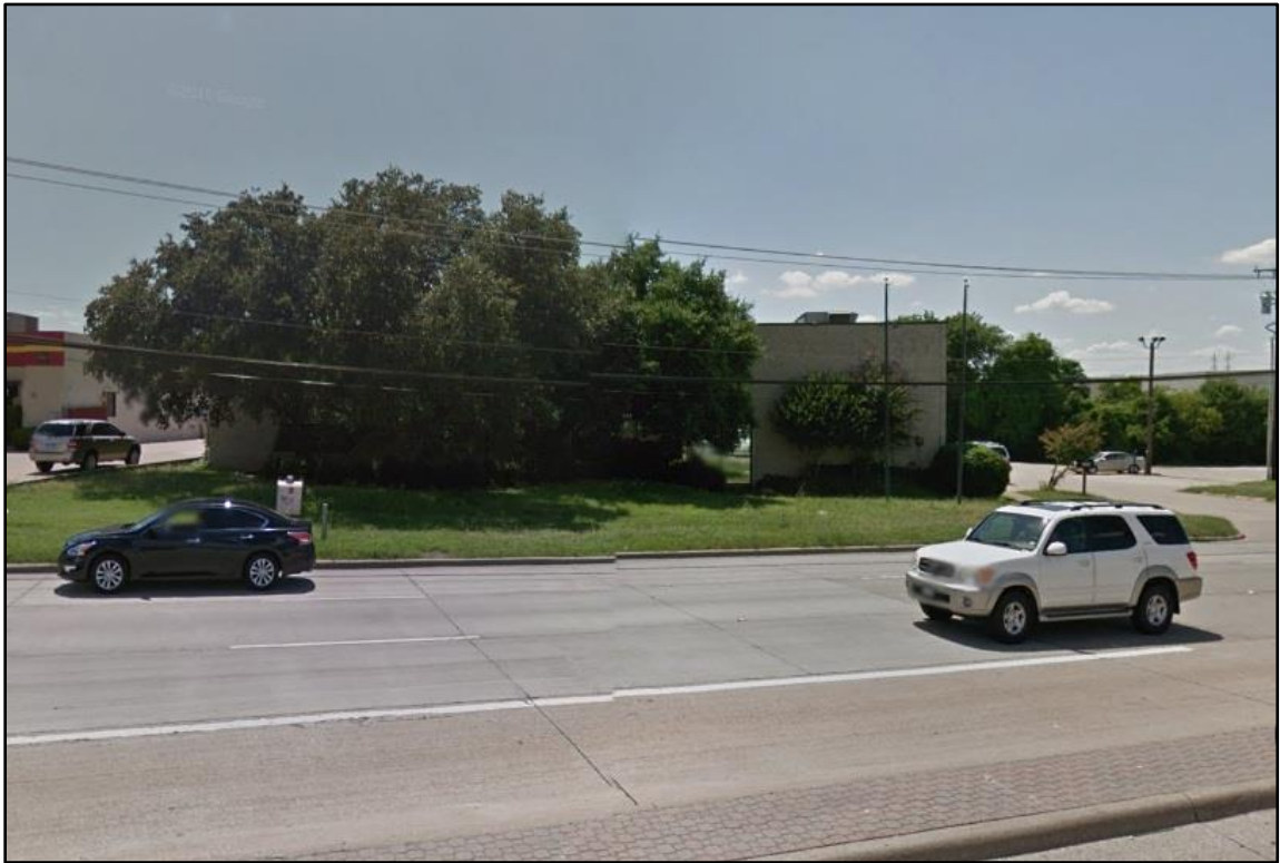
Above: East Façade – Note Existing Mature Trees To Be Retained