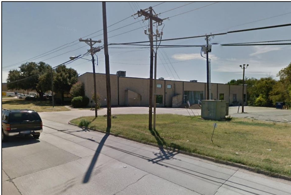
Below: North Façade – Note Rooftop Equipment