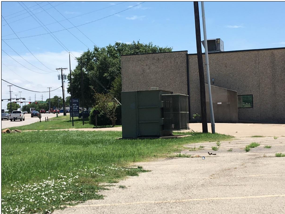
View of Utility Generator – Lack of Landscaping and Screening Along Midway