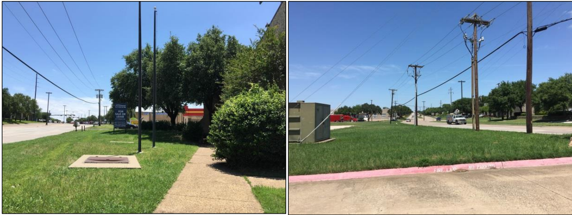
Views Along Midway – North (L) and South (R)