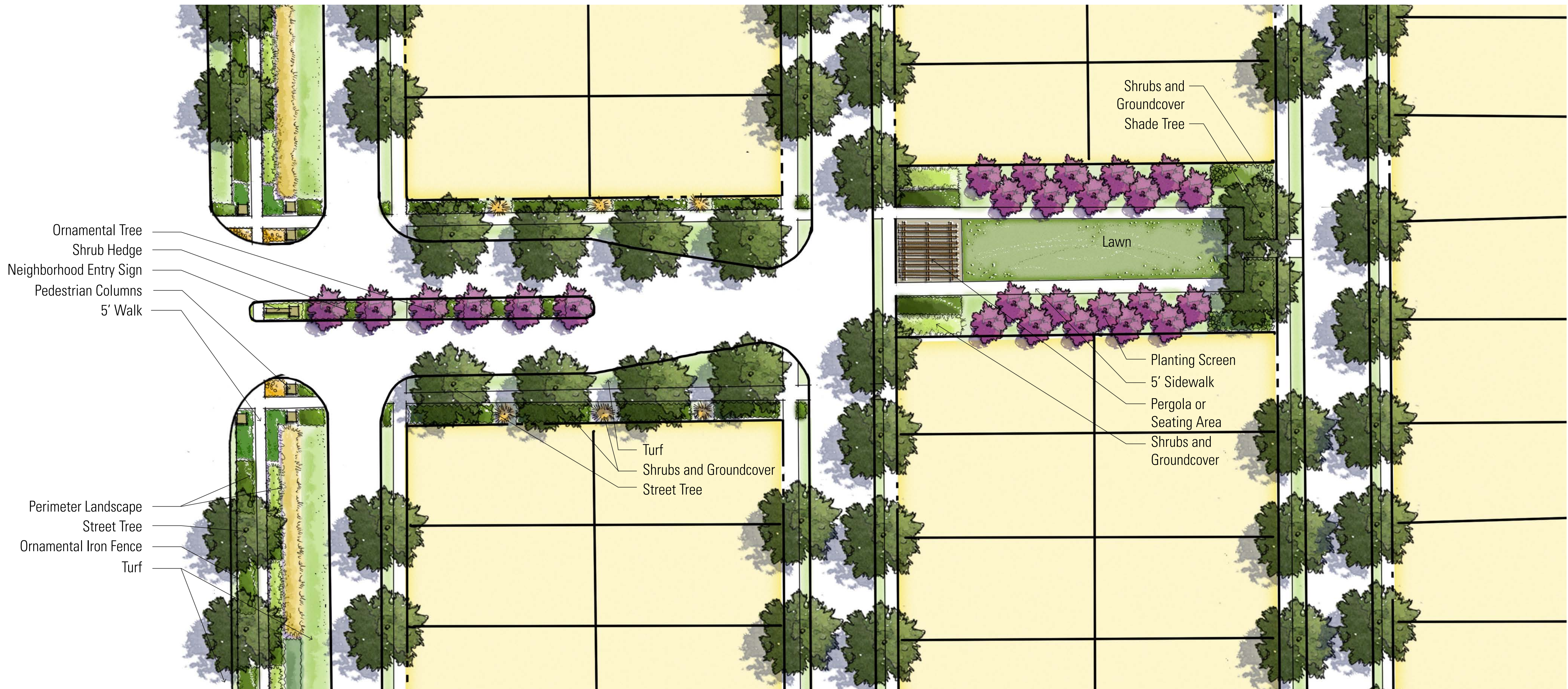
Neighborhood Entryway and Park Plan Enlargement